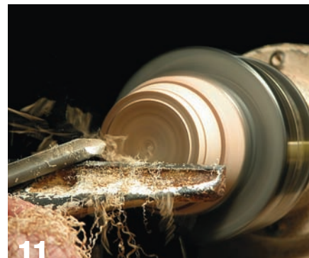
Set your tool-rest height slightly below center with the tool on center.

If you are using a scraper, the handle needs to be up in relation to the tool rest. Scrapers are almost always used this way. Using a scraper with the tool handle down is asking for a big catch.