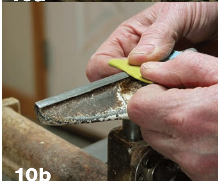
Tune up your tool rest by regularly filing (top) and then sanding (bottom) the surface.

rest is new, file it and round over the edges. If the rest is old, file out the nicks and dings, and then smooth with 220-grit sandpaper. Rub a little paraffin (canning wax) on the surface of the tool rest. You'll be amazed at how it helps the tools slide.