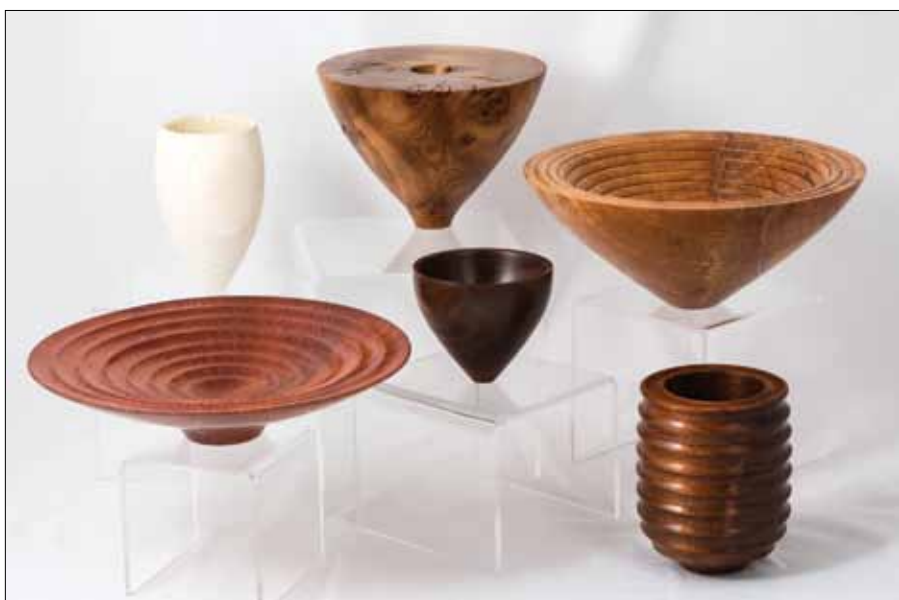
Molly Winton (Edmonds, WA) Caballos Negros Cherry, dye (10" h, 4 1/2" dia)