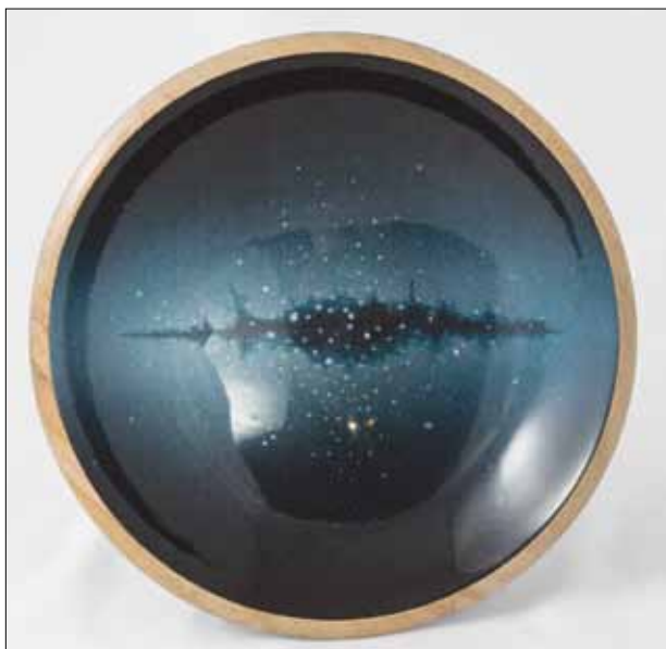
Jay Shepard (Olympia, WA) Crucible: Star Nursery Big Leaf Maple, acrylic (1 1/2" h, 6 1/4" dia)