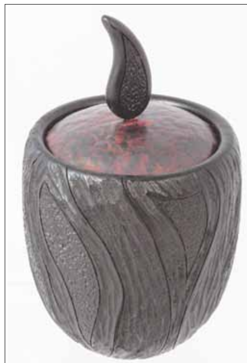
Jennifer Shirley (Indianapolis, IN) Black Flame Cherry, black leather dye, copper, pyrography (4" h, 2 1/2" dia)