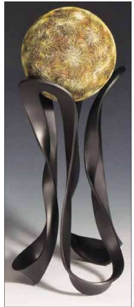
Michael Foster (Springfield, VT) Euclid's Phoenix Sugar Maple, Cherry, India ink, acrylic paint Turned, hollowed, carved, airbrushed (17 1/2" h, 7 1/2" dia)