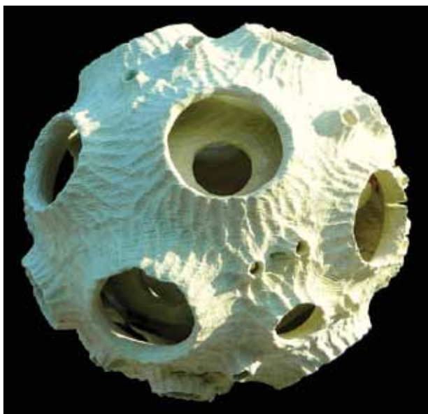
Paul Hedman (Moorehead, MN) Holy Moly Bleached White Oak (12 1/2" dia)