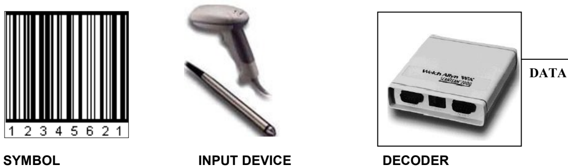
Figure 1 - Machine Recognition of Data

It is important to clarify the distinction between two terms which are erroneously used interchangeably: Scanning and Verifying. Scanning is machine recognition of data encoded in a bar code symbol. (See Figure 1)