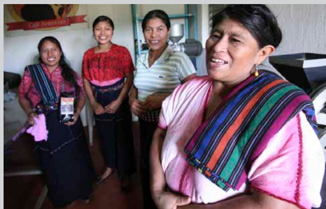
Members of the women-only group that produce "Café Femenino" at the Nahualá cooperative.

As a result of Nahualá's participation in Café Femenino, more women have joined the cooperative. Importantly, in a sector in which men typically collect payment, the women of Nahualá, in accordance with Café Femenino rules, are paid directly, which gives them enhanced visibility of cash flows. Nahualá's women members attend cooperative trainings as often as their male counterparts, although they are still less likely to participate in the cooperative's assembly meetings, indicating that they continue to be underrepresented in decision making at the organizational level. While women still perform "women's tasks" on the farm, such as harvesting and sorting, they are increasingly involved in the steps of coffee production traditionally restricted to men, such as pruning and fertilizer application.