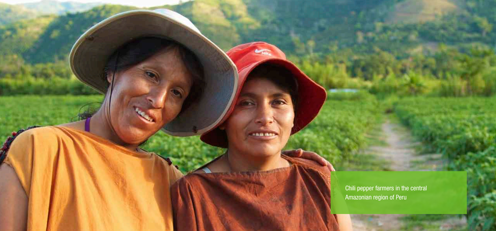
Chili pepper farmers in the central Amazonian region of Peru