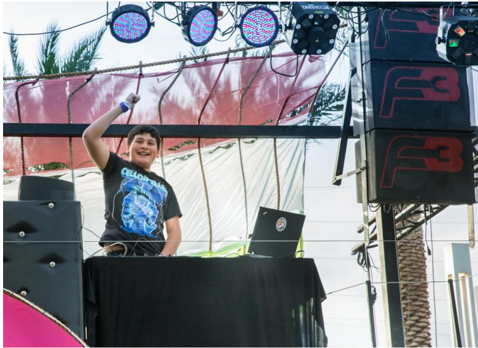
13 – 17 years old