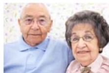
Turn dreams into a reality.

The Centre County Association of Realtors® has entered into an agreement with the Centre County Community Foundation to have the American Dream Housing Fund placed with the Foundation's portfolio. This provides access to an excellent system of investment management and provides all donors to the Fund with tax deductible gift status. The principal raised will provide a perpetual source of assistance providing a legacy to help future generations of those in need in Centre County.