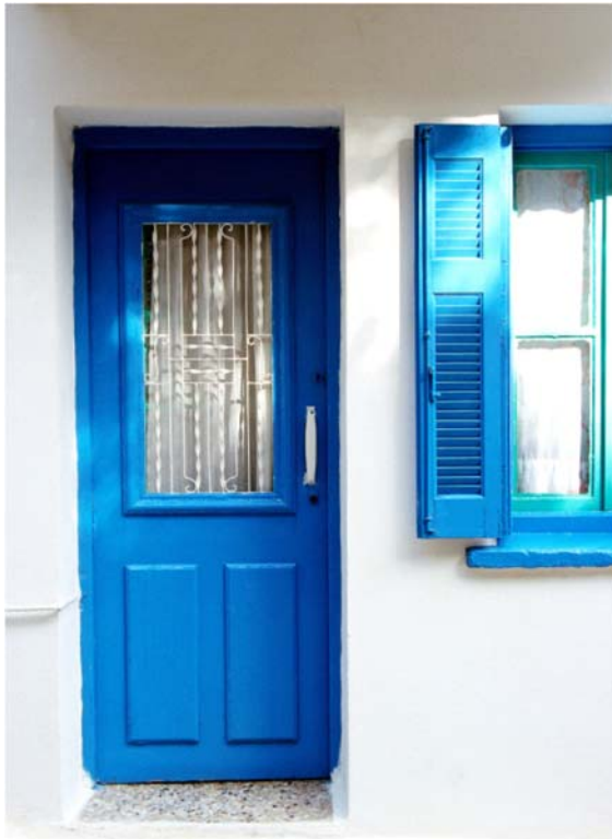
Opening doors in Centre County!

To make dreams come true, contribute to the American Dream Housing Fund.