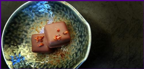
The art of savory chocolate