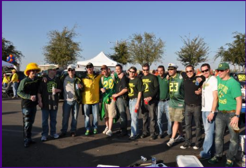
Chi Psi tailgate at the BCS Title Game