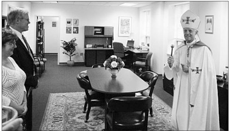
Archbishop Donald Wuerl dedicates Hecker Center for Ministry in Washington, DC.