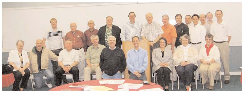
Eighteen canonists attended this year's Advocacy Seminar which focused on the role of the advocate in the context of a case study.