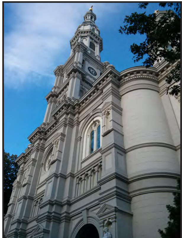
Cathedral of the Blessed Sacrament, Sacramento, CA.