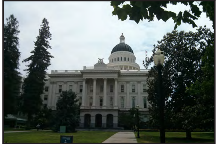
Clockwise, from top left: Meeting space in the Hyatt Regency Sacramento; guest room at the hotel; the state capitol.