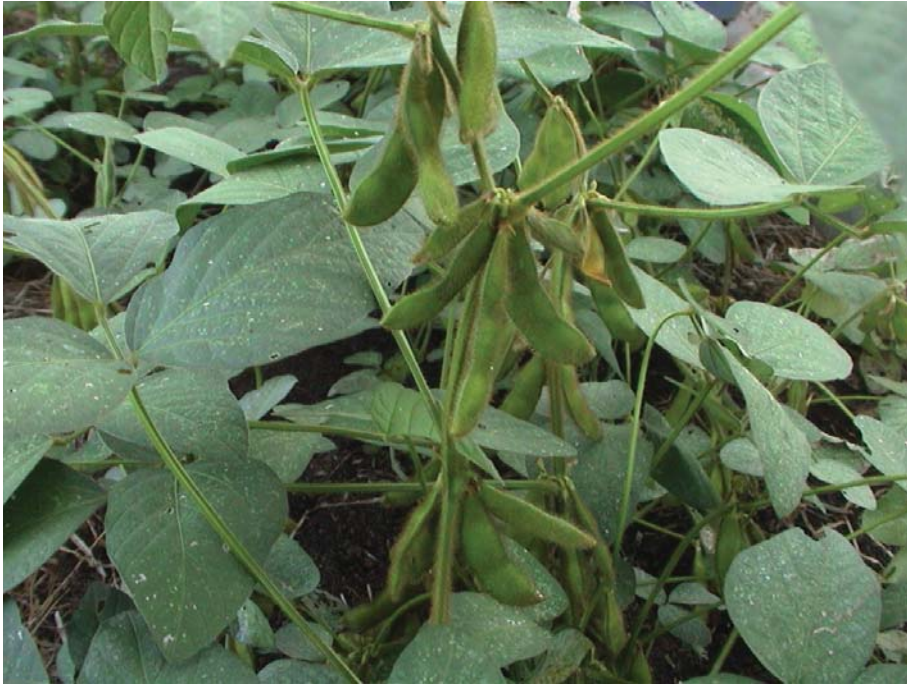
Soybeans and alfalfa are under sown to cover our topsoil.