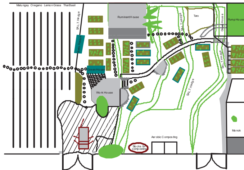
Sample Farm Layout-Aloha House, Mitra Rd., Santa Monica, Puerto Princesa City, Palawan, PHILIPPINES.