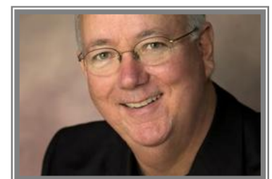
CMC JIM HORAN, AUTHOR OF THE BEST-SELLING BOOK, THE ONE PAGE BUSINESS PLAN