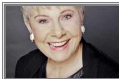
PATRICIA FRIPP, CERTIFIED SPEAKING PROFESSIONAL, CPAE, HALL OF FAME KEYNOTE