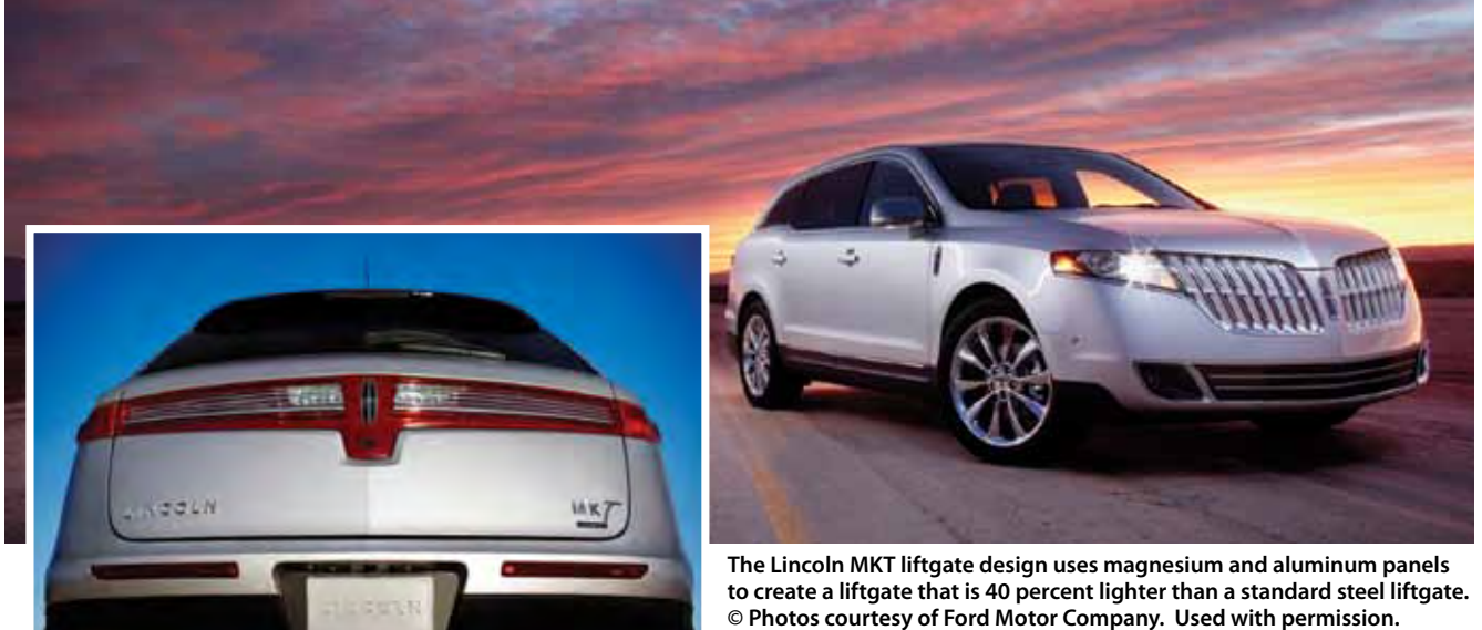
The Lincoln MKT liftgate design uses magnesium and aluminum panels to create a liftgate that is 40 percent lighter than a standard steel liftgate.

Strategic use of lightweight and down-gauged material allows a vehicle's powertrain to be smaller and more fuel-efficient. Combining magnesium with aluminum for the MKT liftgate's panels instead of steel saves 22 pounds in vehicle weight. When coupled with other weight-saving measures, re-matching the vehicle with a smaller powertrain – known as right-sizing of power to weight -- is a key factor in achieving greater fuel economy.