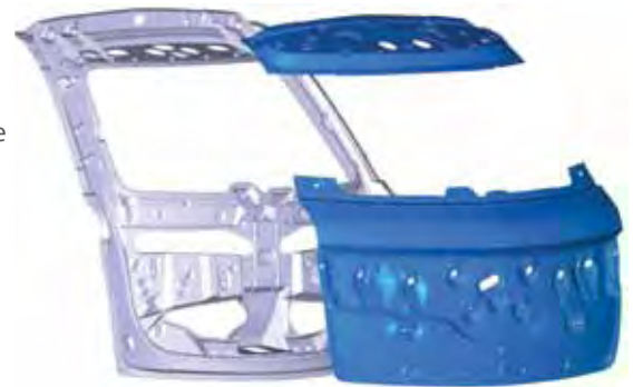
The cast magnesium inner panel, shown in light gray, varies in thickness from 2mm at the thinnest spot, to 7mm at its thickest area. The aluminum outer panel is shown in blue.

The MKT engineers stress that although magnesium raw material cost is more than steel, an all-steel liftgate would be much more complicated and expensive to manufacture than the magnesium/aluminum liftgate, and too heavy for power lift systems to open. Magnesium not only accomplishes Ford's weight reduction goals, it creates new design options. Ford plans to continue reducing vehicle weight by 250 to 750 pounds to help meet strict fuel economy targets without compromising vehicle safety or durability.