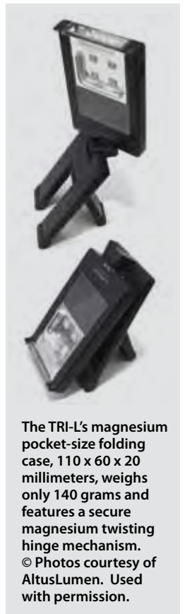
The TRI-L's magnesium pocket-size folding case, 110 x 60 x 20 millimeters, weighs only 140 grams and features a secure magnesium twisting hinge mechanism.

The pocket-size portable light follows the company's guiding sustainability principles that include energy efficiency, using renewable energy, and choosing materials that are recycled and recyclable. AltusLumen engineer and TRI-L project manager Samuel Ng confirms the recycling benefits of AZ91D. Says Ng, "Magnesium is one of the few materials that can be endlessly recycled without degradation. Magnesium is easier to recycle and its value makes it an attractive material to recycle."