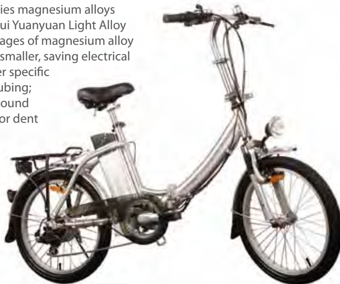
This electric bicycle achieves extended battery life and runs longer on a single battery charge due to the ultra-lightness of magnesium.

The bike's magnesium alloy main frame and luggage carrier components are welded together, and then attached to other bike components with screws. Since lightweight magnesium alloy substantially reduces the bike's weight, its battery unit powers far less weight, thus extending the battery's useful life. Choosing magnesium alloy also supports Hengshui Yuanyuan Light Alloy's environmental goals because it is 100 percent recyclable, and uses less energy during the recycling process than other metals.