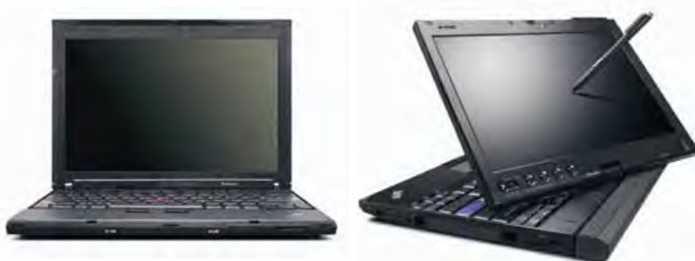
Lightweight magnesium alloy optimizes the Lenovo X201 laptop and X201 tablet's toughness and portability for today's mobile workforce.

Mika Majapuro, Lenovo's Worldwide ThinkPad product manager says, "Lighter than aluminum, the magnesium alloy provides extreme strength and light weight – a combination that enables us to design more ultra-portable PCs for mobile workers. The magnesium alloy material is recyclable and allows for the use of less material."