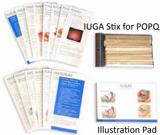
IUGA Stix for POPQ