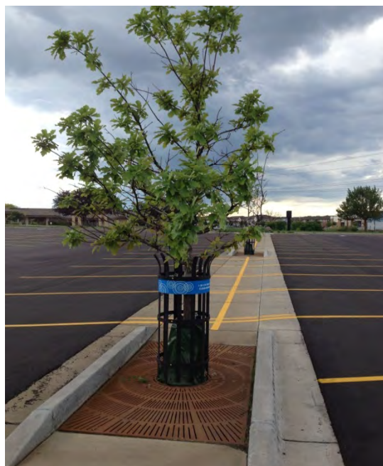
Tree trenches at Maplewood Mall