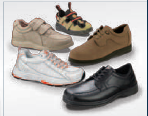
STOCK FOOTWEAR No Return Shipping or Restocking Fees!