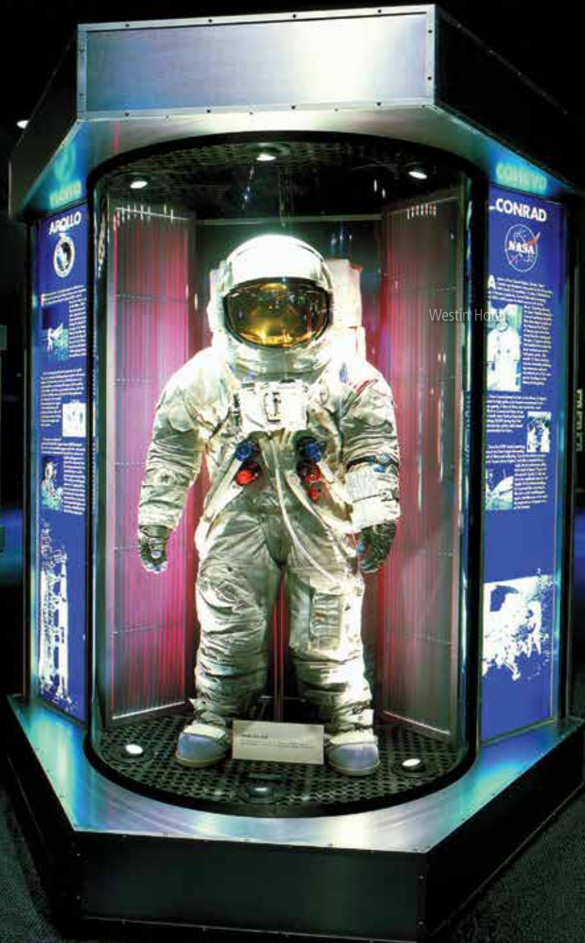
Space Center Houston: This unparalleled exhibit features spacesuits dating back to the first American trip to space and a wall that contains portraits and crew photos of every U.S. astronaut who has flown in space.

If you want to venture further out, spend the day exploring the Museum District, the country’s fourth largest, with 18 cultural powerhouses set within blocks of one another or head down to Space Center Houston, the official visitor’s center for NASA’s Johnson Space Center. Later on, grab a bite in one of dozens of award-winning restaurants, or hang out with the cool kids on Washington Avenue. There’s always something to do in this Southern hospitality meets urban chic city!