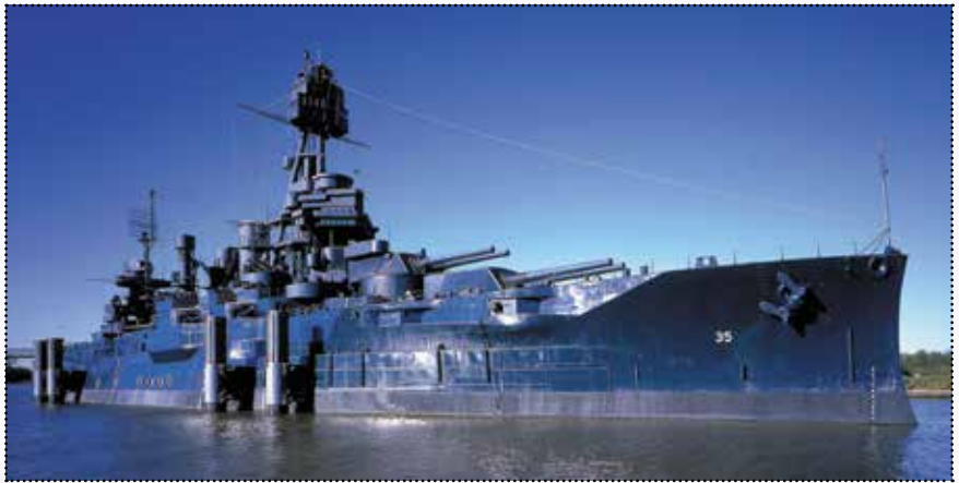
Battleship Texas: The first battleship memorial museum in the U.S. is currently anchored on Buffalo Bayou and the Houston Ship Channel, near the San Jacinto Monument and Museum.