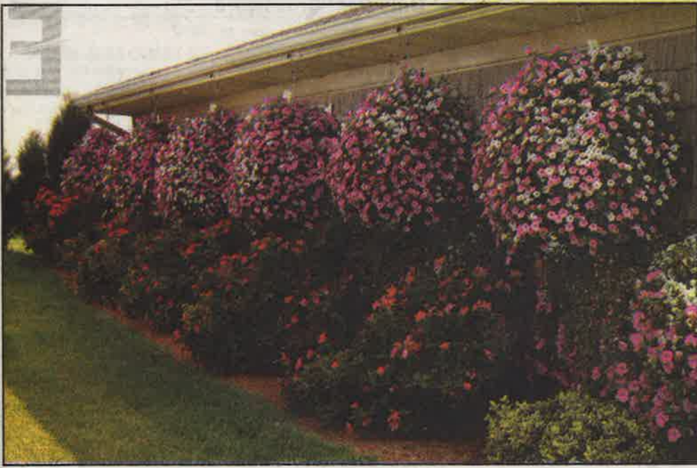
"Vista Bubblegum" petunias spread 36 inches, making an impressive show in hanging baskets.