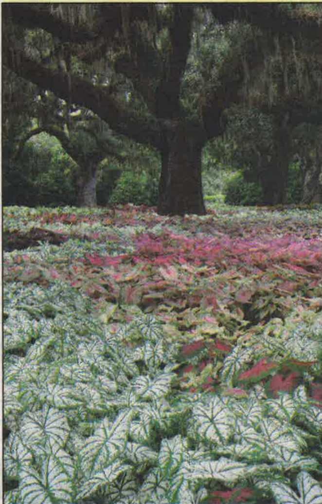
"White Christmas" and other caladiums brighten a shady landscape.

From 2016, two sun lovers — "Graffiti Red" pentas and