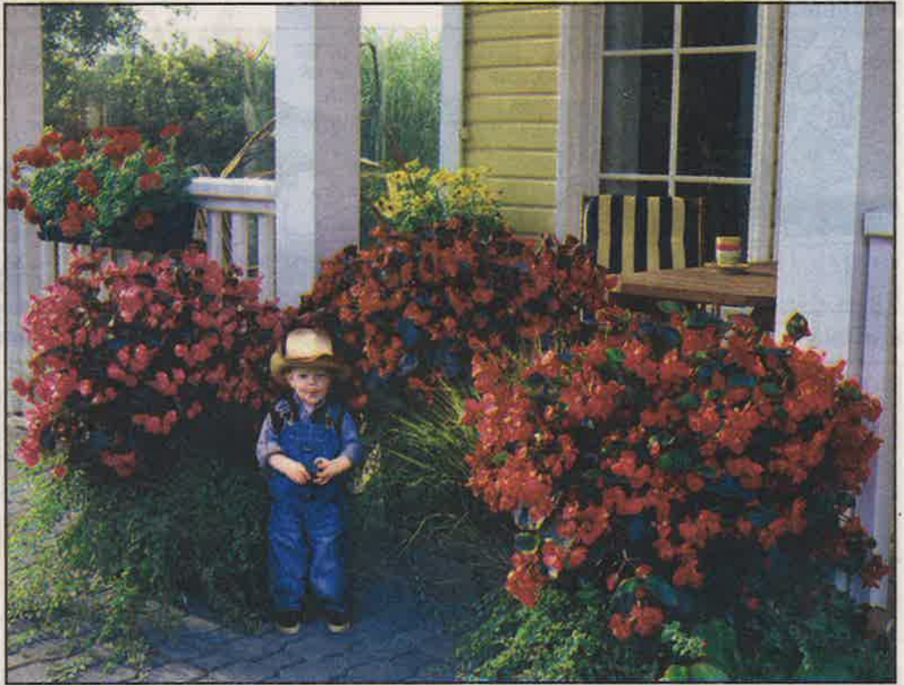
"Big/Whopper" series red begonias aren't shy plants, even in containers.

■ "Graffiti Red" is a newer, compact pentas with bright red flowers that grows up to 10 inches tall. It has a very uniform growth habit, and rarely needs pinching. It will do well in containers or mass-planted in the ground. It needs a minimum of six hours