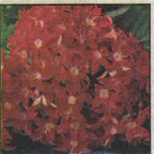
"Graffiti Red" pentas