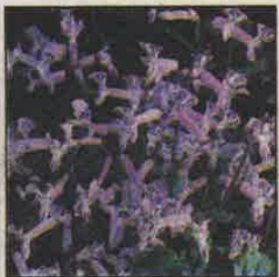
"Velvet Elvis" plectranthus