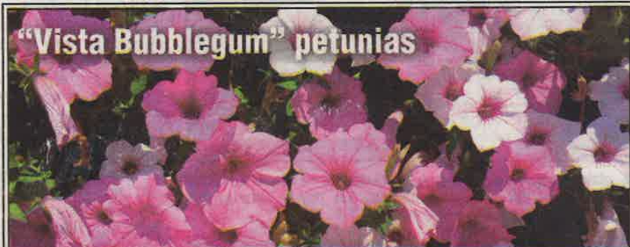
"Vista Bubblegum" petunias