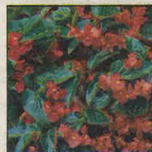
Red dragonweed begonia