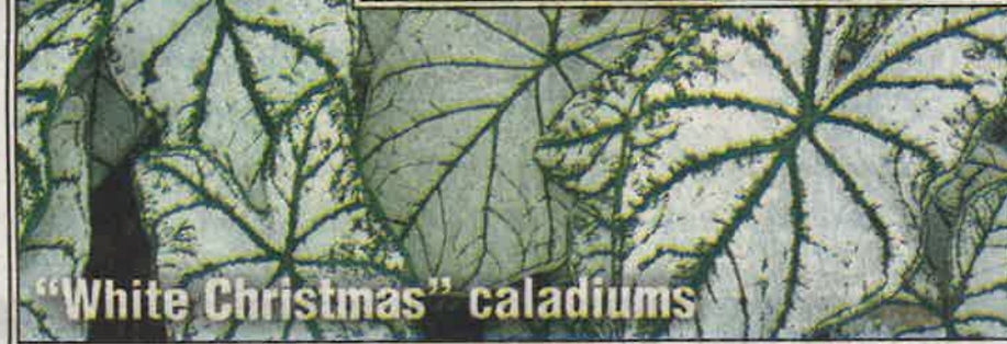
"White Christmas" caladiums