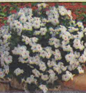
"Cora Cascade Polka Dot" vinca