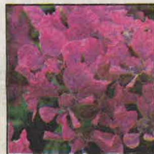
"Sriracha Pink" cuphea