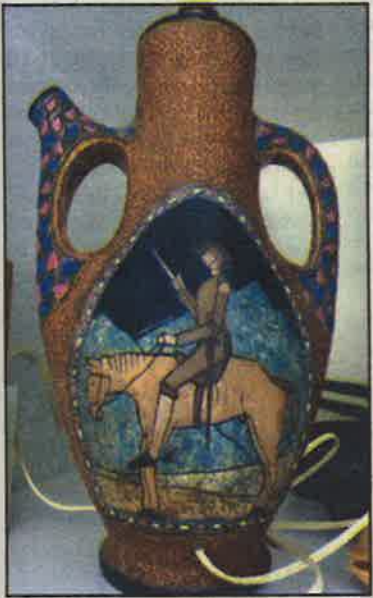
This lamp was once a vase/ewer, but it was converted.