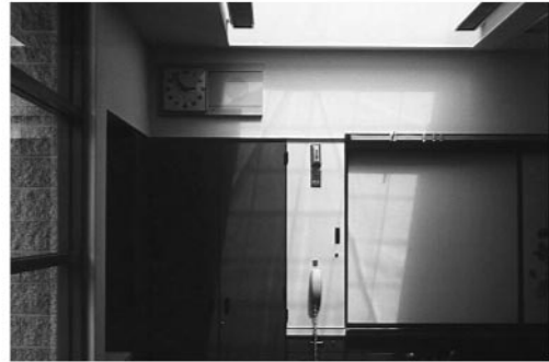
Figure 5—Type B skylight, Capistrano.

A Daylight Code combined the effects of both windows and skylights. It was assigned to each classroom based on a daylighting expert's assessment of the synthesis of the daylighting conditions expected from the combination of window conditions and any top-lighting found in each classroom. The criteria were based on