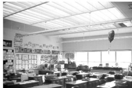
Figure 12—Seattle school with central skylight and diffusing louvers.

monitors or skylights. One school with open-type classrooms has high clerestory windows that allow daylight deep into the building (Figure 11).