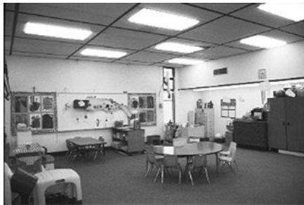
Figure 3—Classroom with window Code 1.