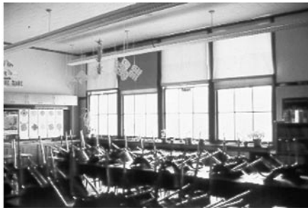
Figure 10—Older Seattle school, Window Code 4.