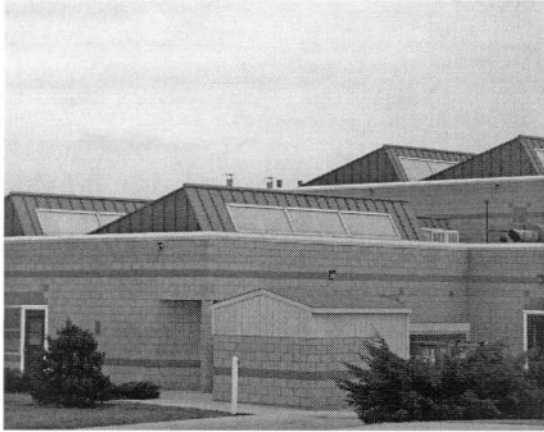
Figure 13—New Fort Collins’ school with saw-tooth roof monitors.