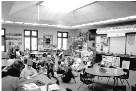
Figure 4—Type A skylight, Capistrano.

There were five types of skylights employed in nine of the Capistrano schools. Two have a diffusing lens that spreads the daylight evenly throughout the classroom (such as Type A skylight in Figure 4 ), while three allow patches of sunlight to enter the classroom (Type B, Figure 5 ). Two of the skylight types are manually controlled, allowing the teacher to dim the daylight, while one type has dimming louvers controlled by an electric switch on the wall, and two others have no controls.