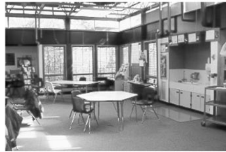
Figure 11—Seattle classroom with clerestory windows.