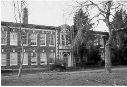
Figure 9—Older Seattle school, Window Code 4.