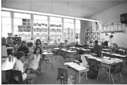
Figure 2—Classroom with window Code 5.

ety of skylight and monitor designs employed. Some designs allowed direct sun into the classrooms while others were diffusing. Some were designed to provide uniform illumination throughout the classroom; others created strong illumination gradients.