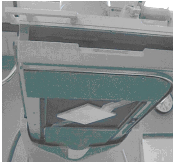
Figure 2. Proper position of resolution test tool on image intensifier of under-table fluoroscopy unit.

The information contained herein is for guidance. The implementation and use of the information and recommendations are at the discretion of the user. The mention of commercial products, their sources, or their use in connection with material reported herein is not to be construed as either an actual or implied endorsement by CRCPD.