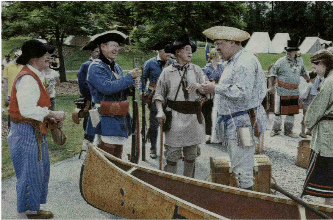
Travel back in time to the 18th Century to relive the days of the French fur trade during the Forest Preserve District of Will County's "Island Rendezvous" at Isle a la Cache on June 14 and 15 in Romeoville.