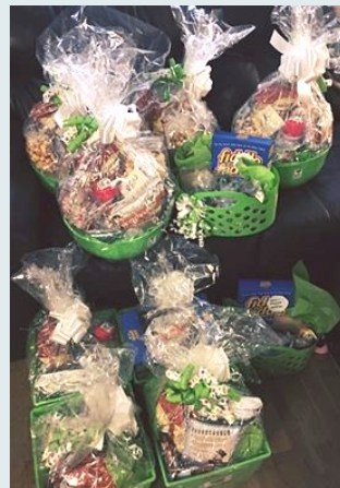
Gift baskets were delivered to each unit.