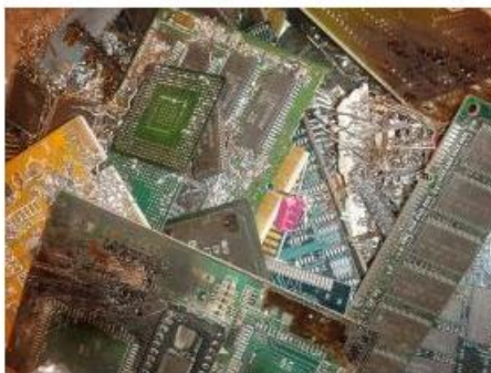
Enlarge image

Two years after its enactment, a New York state law governing the recycling of electronic waste is making an impact according to a progress report. The study from the Product Stewardship Institute (PSI) shows more involvement from industry, but a number of the big box retailers are still lagging behind.