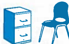
Mixed Metal/ Plastic Objects