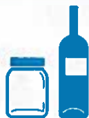
Glass Jars and Bottles