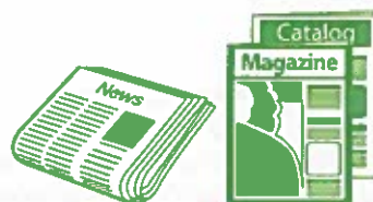
Newspapers, Magazines, Catalogs