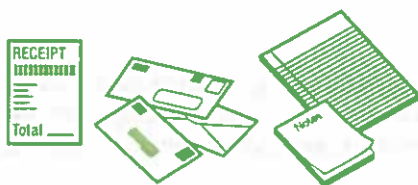
Receipts, Mail, Office Paper, Folders