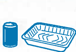
Metal Cans, Aluminum Foil