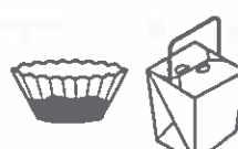
Soiled or Coated Paper