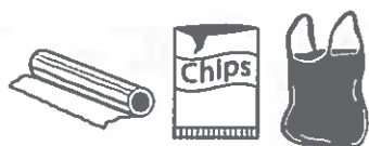
Plastic Film and Wrap, Plastic Bags*