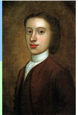
Image: Sydney Parkinson self-portrait. Illustrator Parkinson was the first Friend to visit Australia, with James Cook in 1770. At the time, global concentrations of carbon dioxide were about 270 parts per million. In 2015 ppm now exceed 400.