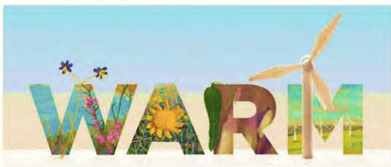
Keeping warm with wool, by knitters from around the world

Using less and focusing on sustainable practices around consumer practices bring great rewards to the planet and our future selves – celebrating the sense of achievement and the creativity of making and doing things that are the work of our own hands and minds, holding a particular person in mind.