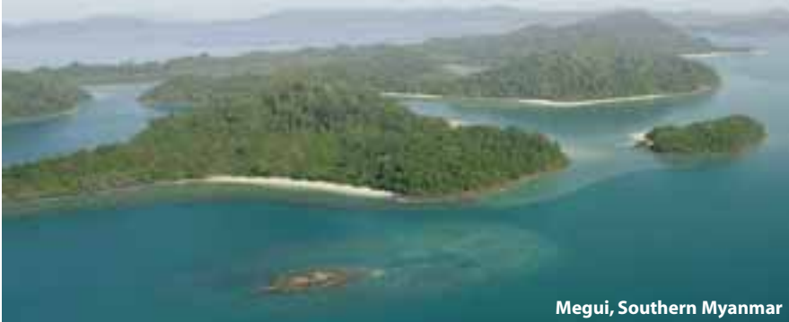
Megui, Southern Myanmar

11 ‘When we take up a language spoken by a people on the other side of the earth, whose very thoughts run in channels diverse from ours, and whose modes of expression are consequently all new; when we find the letters and words all totally destitute of the least resemblance to any language we have ever met with, and these words not fairly distinguished, as in Western writing, by breaks, and points, and capitals, but run together in one continuous line, a sentence or a paragraph seeming to the eye but one long word; when instead of clear characters on paper, we find only obscure scratches on dried palm leaves strung together, and called a book; when we have no dictionary and no interpreter to explain a single word, and must get something of the language before we can avail ourselves of the assistance of a native teacher, that means work’ (Judson on his Burmese beginnings).