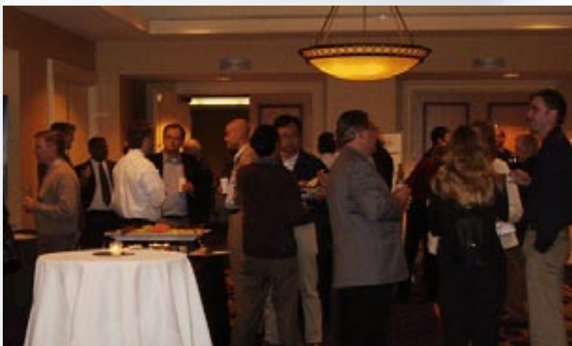
The opening reception for BioInterface Workshop & Symposium was sponsored by SurModics. Attendees repeatedly commented on the manageable size of the conference (about 120) and opportunities to network as big pluses of the conference.