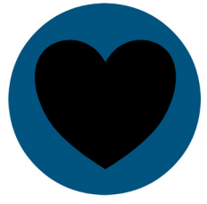
OPEN TO PUBLIC