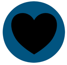
OPEN TO PUBLIC