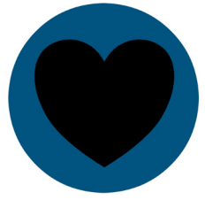
OPEN TO PUBLIC