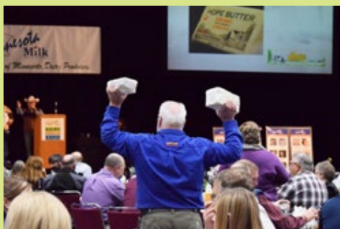
The scholarship auction made for great investment in dairy youth.