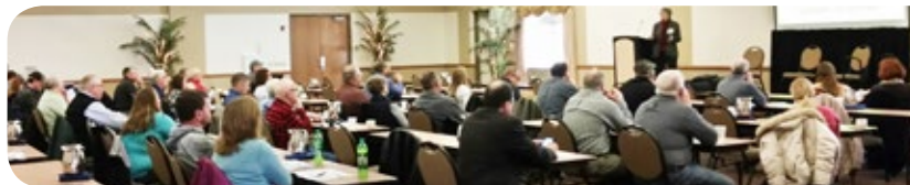
Dairy marketing topics headlined the 2016 Minnesota Milk Dairy Management Workshops