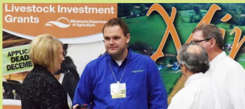
Visits on the trade show floor were useful to both exhibitors and dairy farmers.