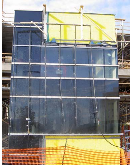
Figure 5: Static water test performed prior to rain screen material being installed at a on site mock up

The type of enclosure system used for the project can help determine when to run the tests. For instance, buildings using a rain screen principle may want to consider performing some of tests prior to the final installation of the rain screen material. This allows easier accessibility for locating and repairing any issues discovered at the primary air vapor retarder / barrier seal during testing.