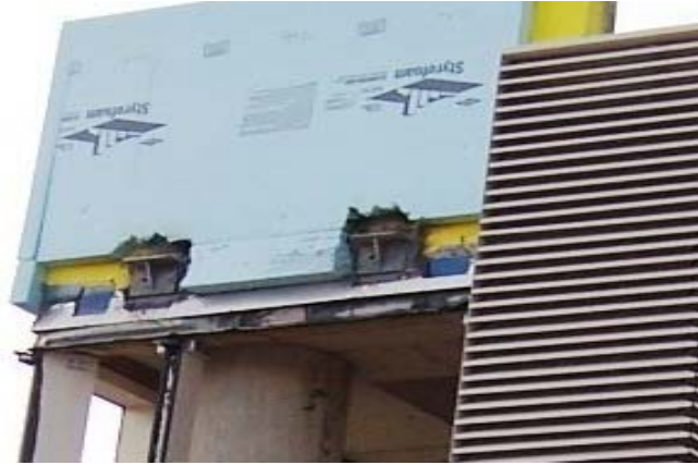
Figure 3: Mock ups help determine contractor sequencing and discover potential issues prior to actual installations on the building

Details to be included in the mock should consist of any difficult three dimensional transitions and areas with more than two products interfacing, as these are the details that often require refining. As programs like BIM become more common, and three dimensional transitions can be more clearly depicted, drawn, and scrutinized, less detail changes are anticipated.