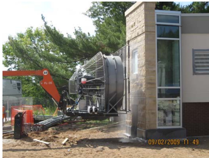
Figure 3: Dynamic water test being performed at an on site mock up

Site built mock ups are typically constructed out doors near the area where the building will be constructed. This can create some difficulties in the construction and testing schedule because of weather issues and delays. However, positive aspects to this are: it allows for an installation in the exact climate and conditions as will occur on the building, the tradesmen are normally local and therefore there is no extra travel cost, and if constructed with the selected colors for the project it functions as an aesthetic mock up for owners and architects to easily review. Finally, if left in place during actual construction, it can be used for setting expectations and review of difficult details.