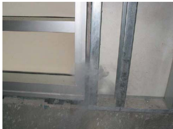
Figure 1: ASTM E 1186 Smoke Tracer Test at a mock up to locate air leakage locations

Some of the typical tests for a mock up include; ASTM E 283-99 for Air Infiltration, ASTM E 331 -00 for static water pressure resistance, AAMA 501.1-83 for dynamic pressure water resistance, ASTM E 330-97 for structural performance, ASTM E 1186 Smoke Tracer Test, along with thermal cycling and condensation evaluation. Of these tests, the dynamic water and thermal condensation evaluation are typically not performed at on site mock ups. As a substitute for the thermal condensation evaluation, computer thermal imaging reports may be used.