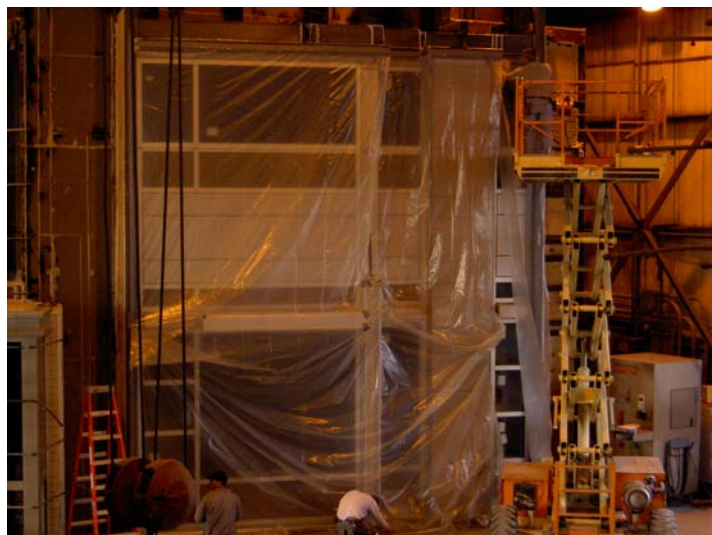
Figure 2: Mock up built and tested indoors at a certified testing facility

Once an owner understands the benefits of a mock up and agrees to incorporate one into their project, the next step is to discuss where to build it. The two most common places are at a certified testing facility, or on the construction site. All of the same tests may be performed at either place. Some of the benefits of a lab include: allowing for construction and testing of the mock up in a controlled indoor environment (reduces over all time on the mock up), the ability to add tests, or alter sequencing of the test because all of the equipment required for testing are at the labs immediate disposal.