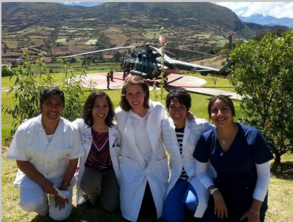
It's me (second from left) with other Christian medical missionaries at Hospital Diospi Suyana in Curahuasi, Peru, taken May 30, 2014 during a visit from Peru's president