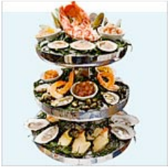
Restaurant Review: Oceana