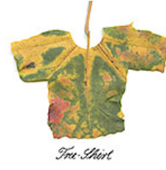
Christoph Niemann: Bio-diversity