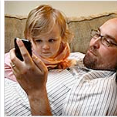
Library in a Pocket

Attention, American shoppers: the world can live without you.