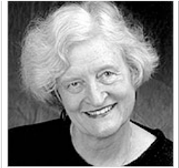
Gratitude's Grace Can Be Itself a Gift

Home | World | U.S. | N.Y. / Region | Business | Technology | Science | Health | Sports | Opinion | Arts | Style | Travel | Jobs | Real Estate | Automobiles | Back to Top Copyright 2009 The New York Times Company | Privacy Policy | Terms of Service | Search | Corrections | RSS | First Look | Help | Contact Us | Work for Us | Site Map